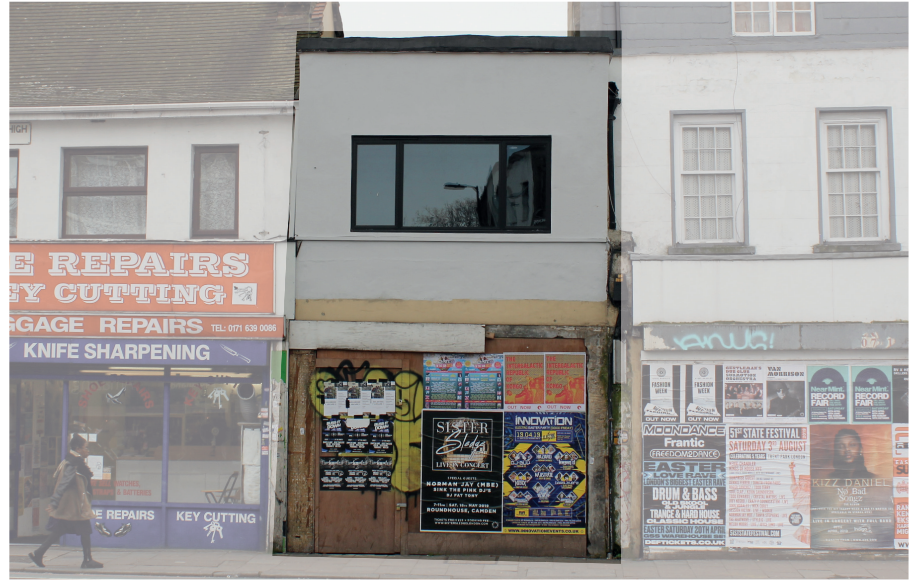
Peckham High Street in 2019 - JKA