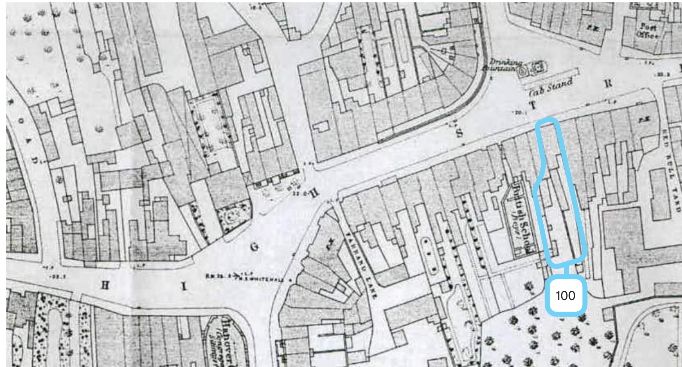
Peckham in 1871 - Ordnance Survey Sheet X1.37