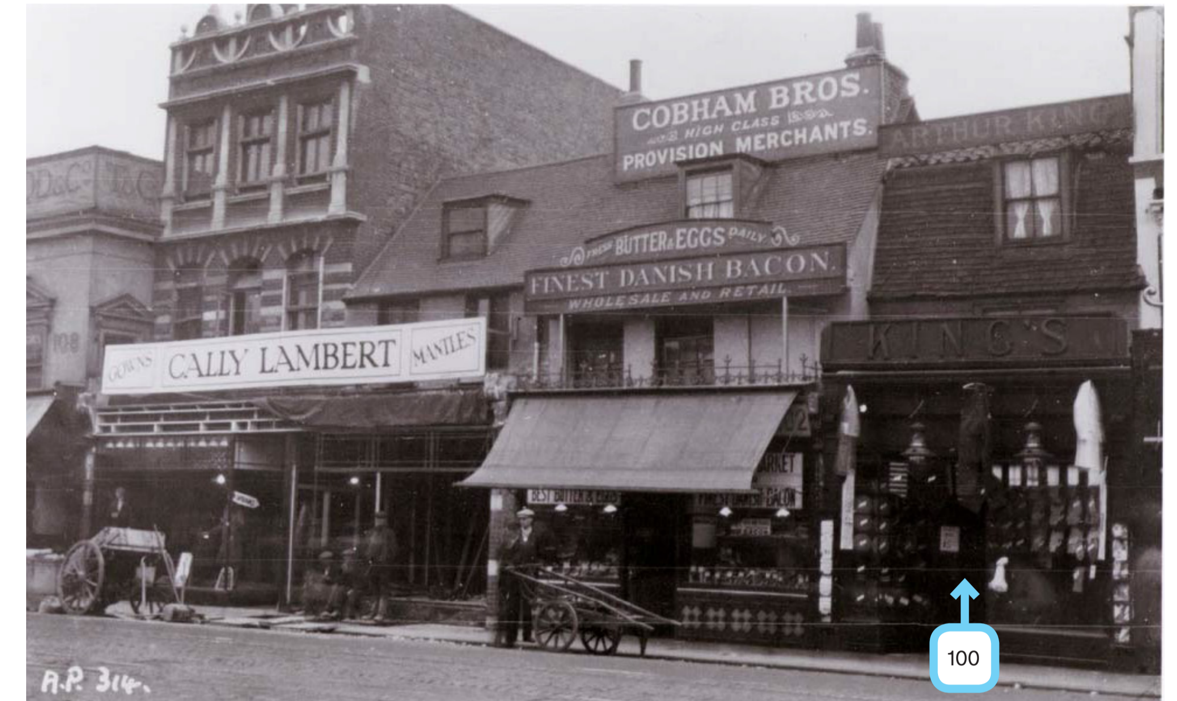
Peckham High Street in 1928 - English Heritage A.P 314