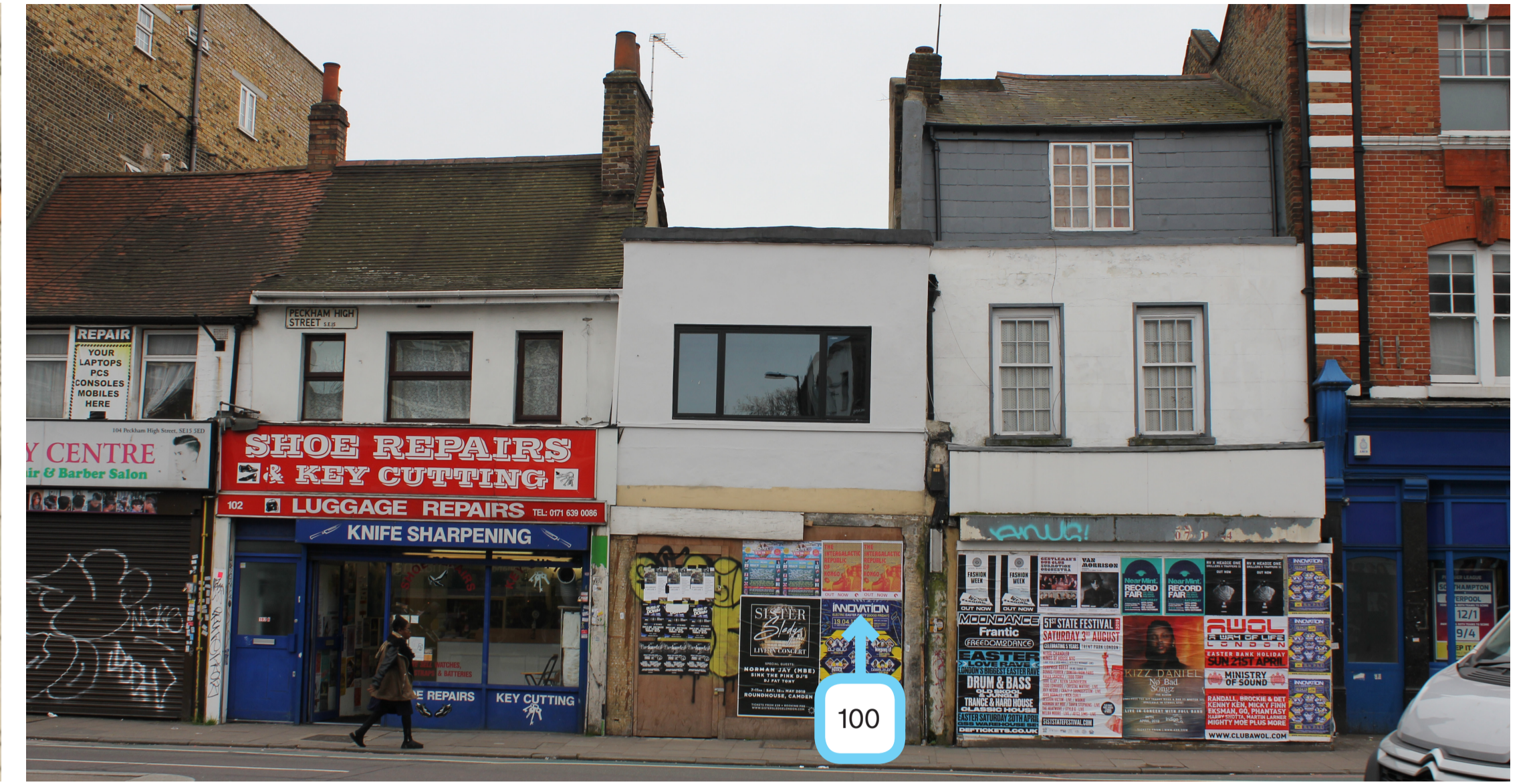
Peckham High Street in 2019 - JKA