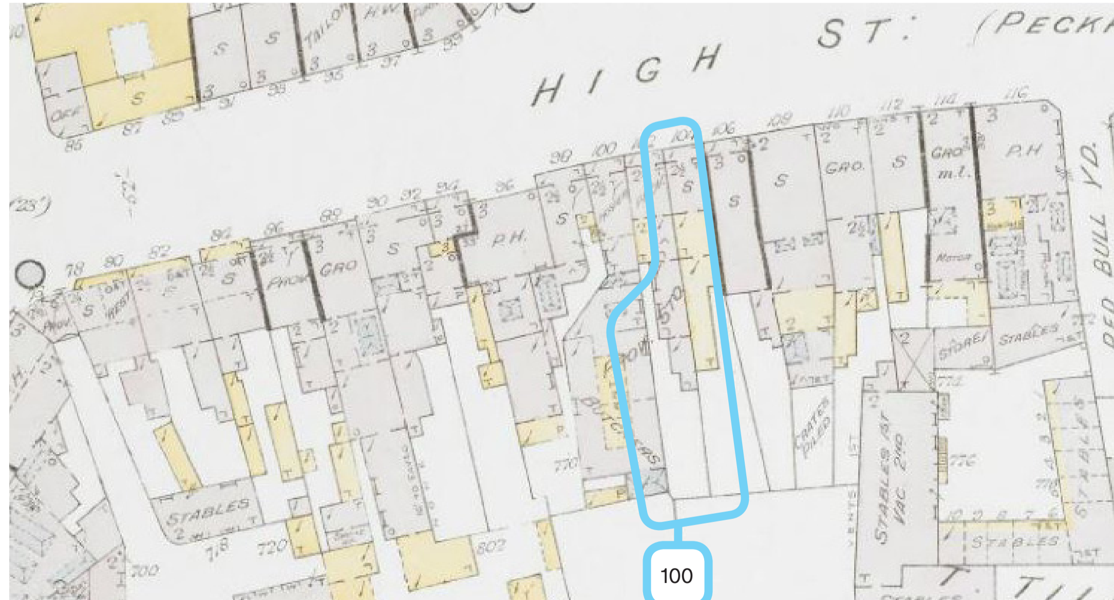
Peckham 1903 - London South East District Vol J, Sheet 47