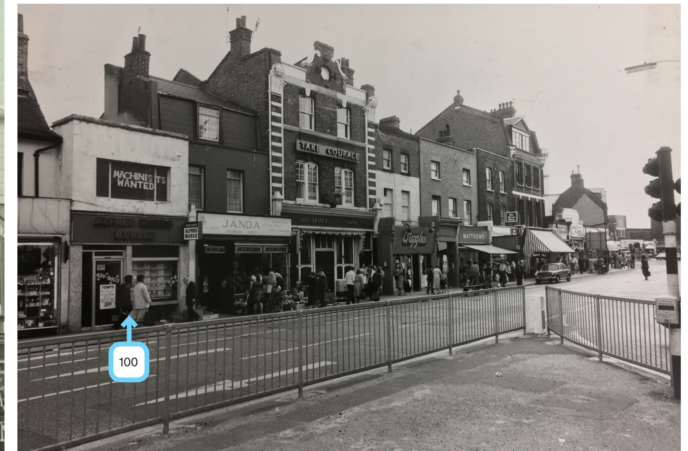
Peckham High Street in 1979