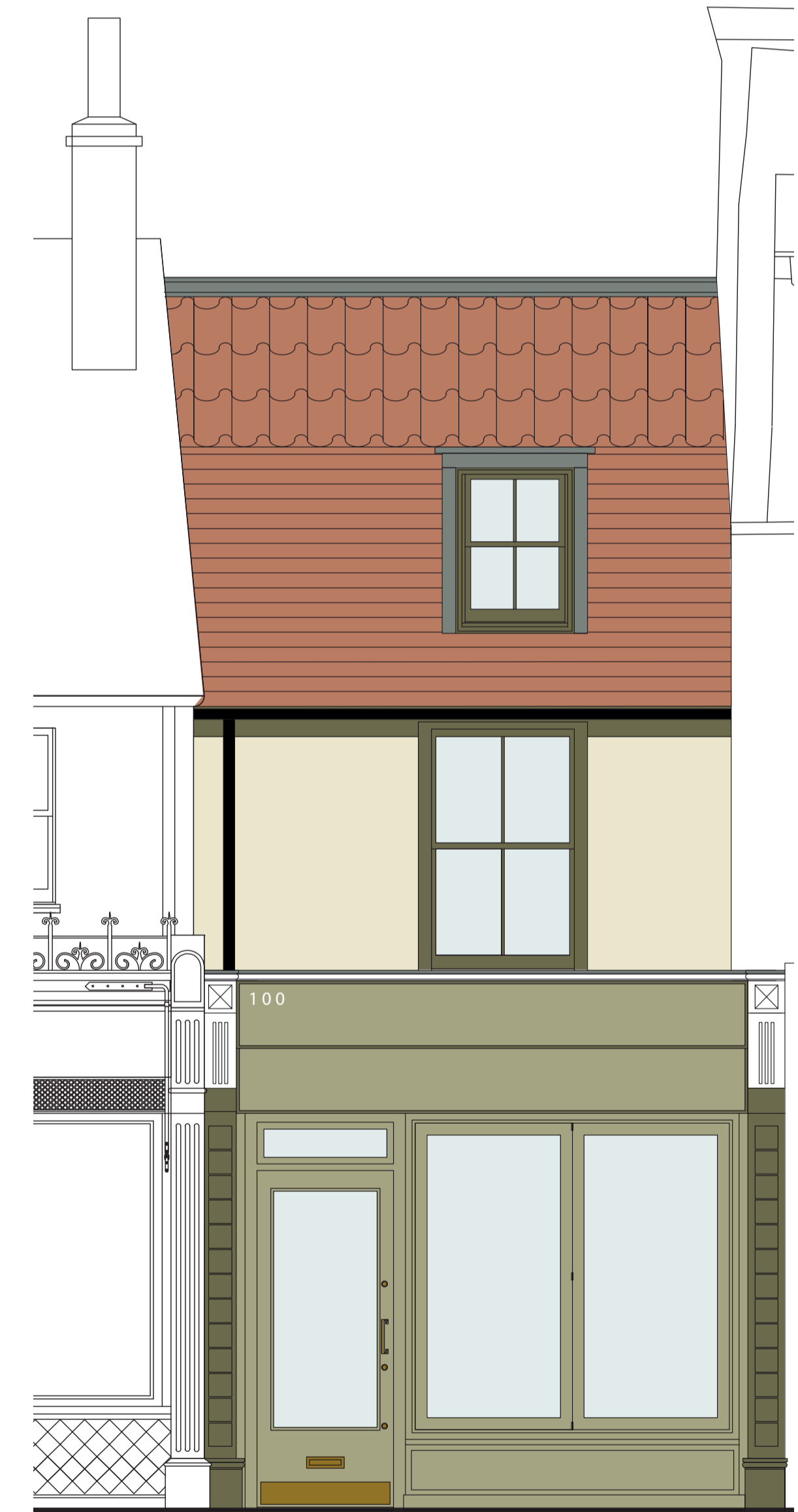
Proposed changes to 100 Peckham High Street