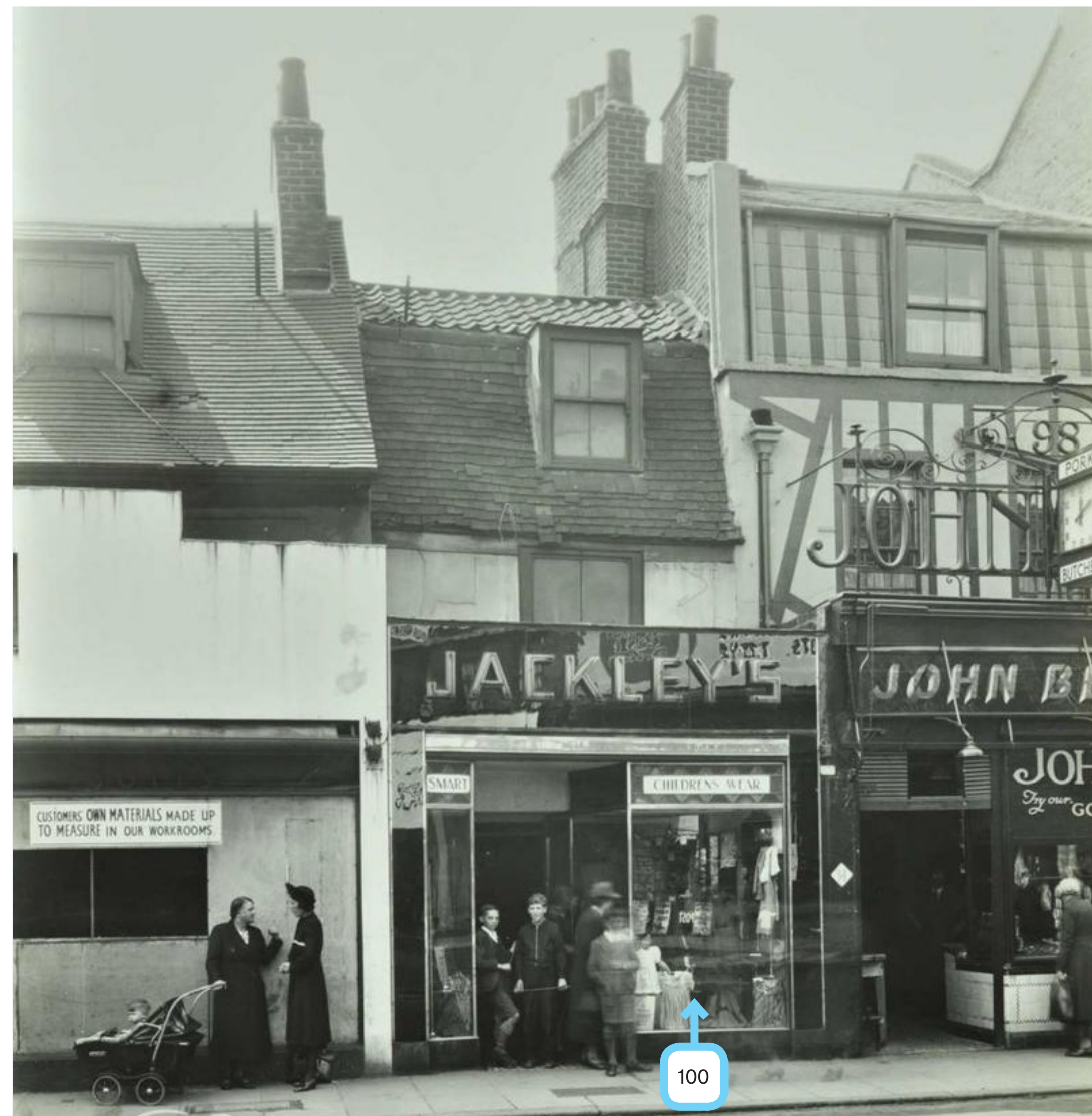
Peckham High Street in 1942

Two buildings in this group, 100 and 102 Peckham High Street, are included in the Peckham Townscape Heritage Initiative programme of repairs and restoration works. At the time of writing, 102 has been repaired and a new shopfront installed and works to 100 are due to be completed by November 2022. The works to this building will be transformative: the 1950s addition will be removed, and the first floor and roof will be reinstated to align with the neighbouring buildings. There will also be repair and restoration work to the former school building at the rear.